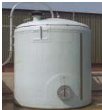
Salt saturator with level inspection & dust extraction

PURESEP's industrial softener range includes steel lined & FRP vessels loaded with SAC resins. Vessels sizes range from 0.1 - 2.0m diameter.