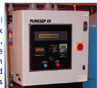
Process control panel

Process control systems for back wash, regeneration, rinse & service cycles, range from stager controlled multi-port valves through to PLC control panels with