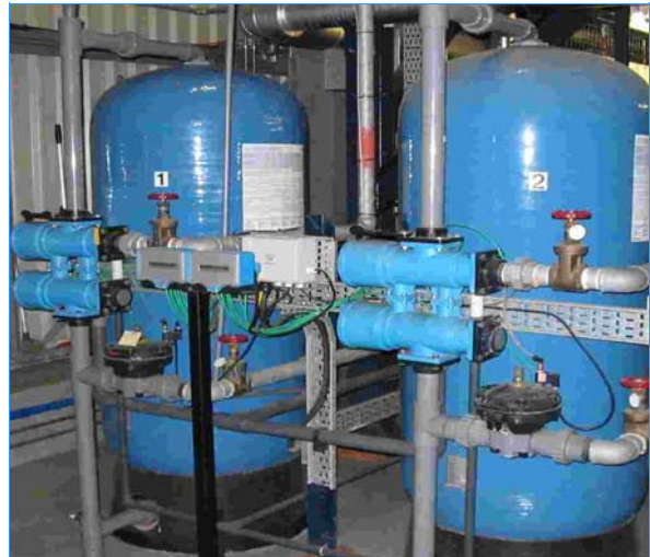
20m 3 /hr duplex dealkaliser

Gas stripping columns come complete with water sump & blower, to reduce CO 2 levels down to 5 mg/l, with optional outlet pH correction dosing pump & sensor.