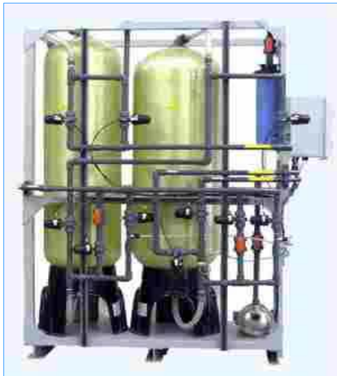
Skid mounted two-bed demineraliser

Product water quality is between 25 - 0.5 \mu\text{S}/\text{cm} conductivity, depending on feed water quality & resin format.