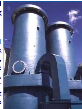
Gas stripping columns

Gas stripping columns come complete with water sump & blower, to reduce CO 2 levels down to 5 mg/l, with optional outlet pH correction dosing pump & sensor.