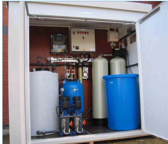
Self contained duplex softener

Salt saturators & brine tanks are an integral component of any softener system with air check valve, brine draw & fill lines.