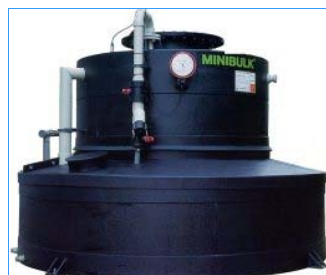
Hydrochloric acid bulk storage & fume scrubber

Hydrochloric acid (28%) is used to regenerate the WAC resin exchanging hard ions with H + ions.